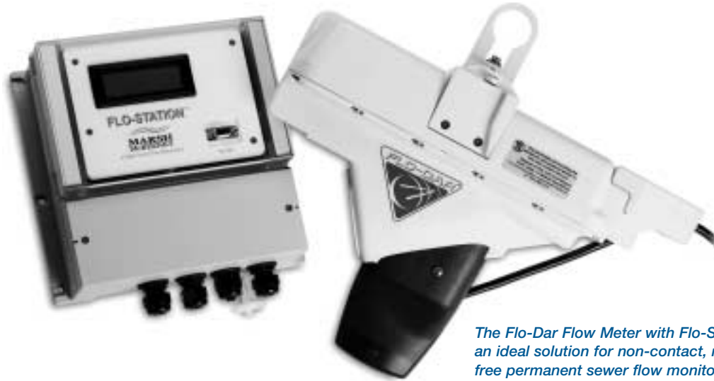
The Flo-Dar Flow Meter with Flo-Station provides an ideal solution for non-contact, maintenance-free permanent sewer flow monitoring.